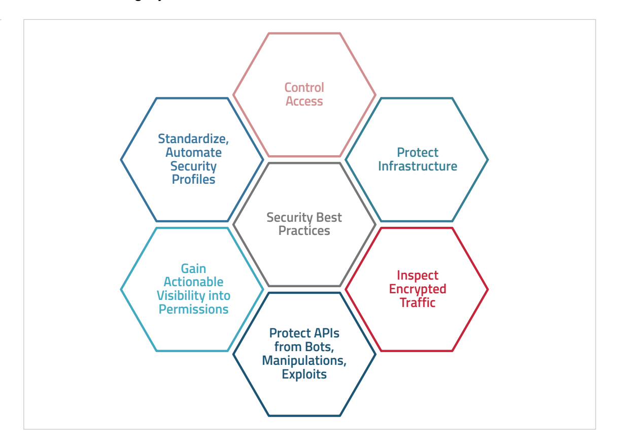
Figure 2 Best Practice for Scaling and Securing Applications

Here are six best practices to ensure security doesn't become a roadblock to innovation and agility.