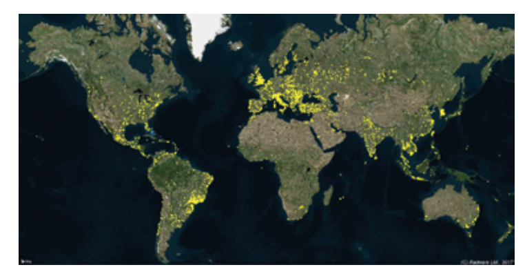
Figure 3. Hajime's geographic reach, with every dot accounting for a unique IP that Radware was able to identify as an infected device

Figure 2: Message periodically displayed on the terminal by Hajime.