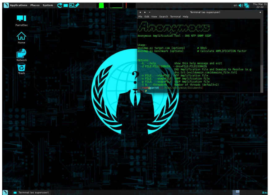
Figure 9: Tool – Reflective DDoS