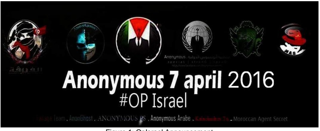
Figure 1: Oplsrael Announcement

With the stated goal of "erasing Israel from the internet" in protest against claimed crimes against the Palestinian people, Anonymous will launch its yearly operation against Israel. Named OpIsrael, it is a cyber-attack timed for April 7th by an array of hacktivist groups that join forces with the greater Anonymous collective (see Figure 1). For this year's attack, hackers have provided tools and technical guidance for the execution of OpIsrael.