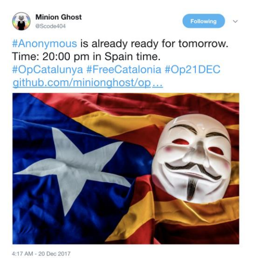
Figure 2: @Scode404 Announcing the official start time for OpCatalunya

In October 2017, citizens of Catalonia – an autonomous community in Spain - held an independence referendum. This call for independence created a conflict between the Catalan leadership and Spanish government and increased law enforcement presence in Catalonia. As a result, the hacktivist group Anonymous launched a <u>series of cyber-attacks</u> against Spanish institutions in protest. The Anonymous operation has already seen three waves of attacks with a fourth operation staged to begin on December 21, 2017 in parallel with Catalans regional election.