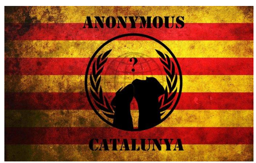
Figure 1: OpCatalunya Banner

Anonymous plans to officially launch phase 4 of Operation Catalunya in support of Catalan independence, at 8pm Central European Time on Thursday, December 21st.