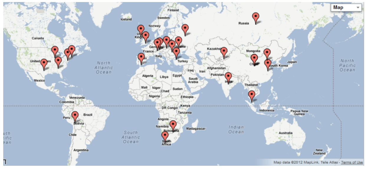
Figure 5- HTTP Flood Sources Geographical Locations

The HTTP requests used in this attack followed a specific pattern. The pattern included a simple GET request to several (legitimate) locations within the site and a randomized input parameter.