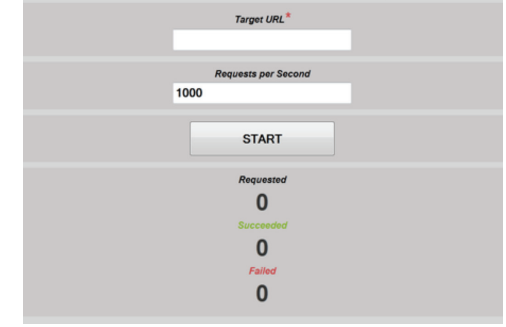
Figure 4 - LOIC Apache Killer

Although this attack technique has proved to be quite