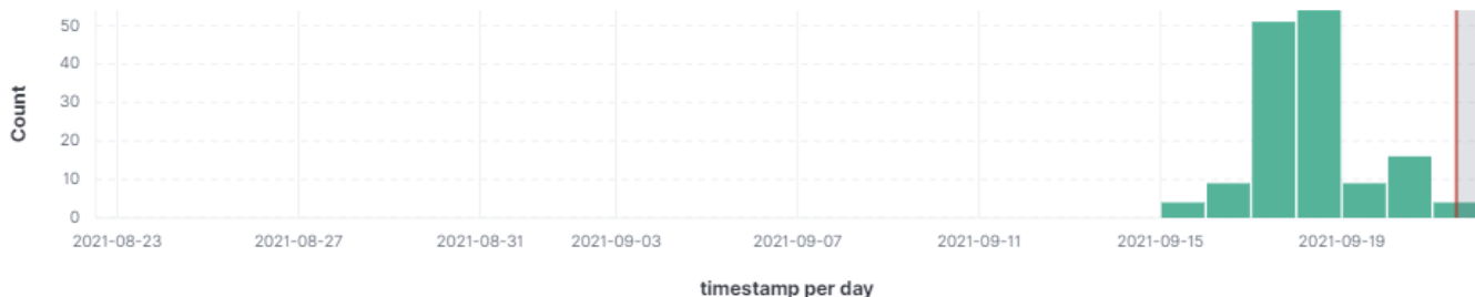
Figure 1: Dark.IoT OMIGOD (CVE-2021-38647) exploits

The operators behind the Dark.IoT botnet demonstrated their ability to leverage and test recently disclosed vulnerabilities quickly. In some cases, the operators have been able to incorporate exploits within hours of publication. With the most recent updates to the Dark.IoT botnets, Radware’s deception network recorded OMIGOD exploits carrying the Dark.IoT signature (“Agent-Header: Dark”) starting September 15, 2021, only a few hours after the proof of concept was made public.