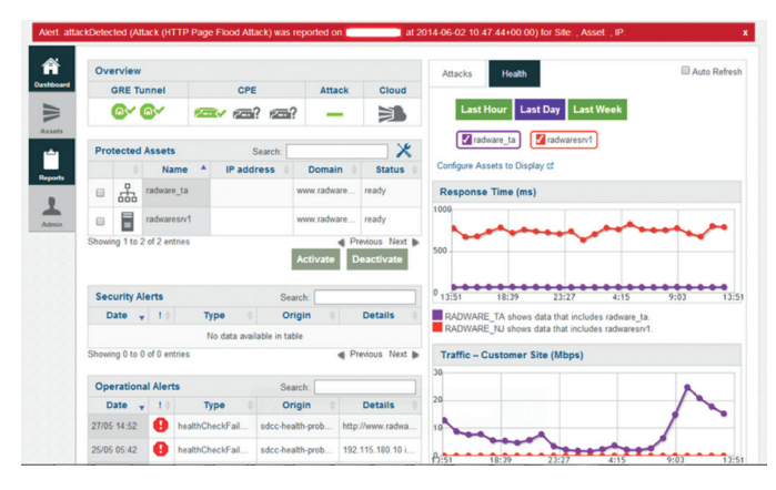
Figure 3: Portal Dashboard

"Radware's attack mitigation solution mitigates both known and new forms of attacks while allowing legitimate business traffic to be handled as normal, so the business continuity of our hosted cloud customers is preserved even while under attack."